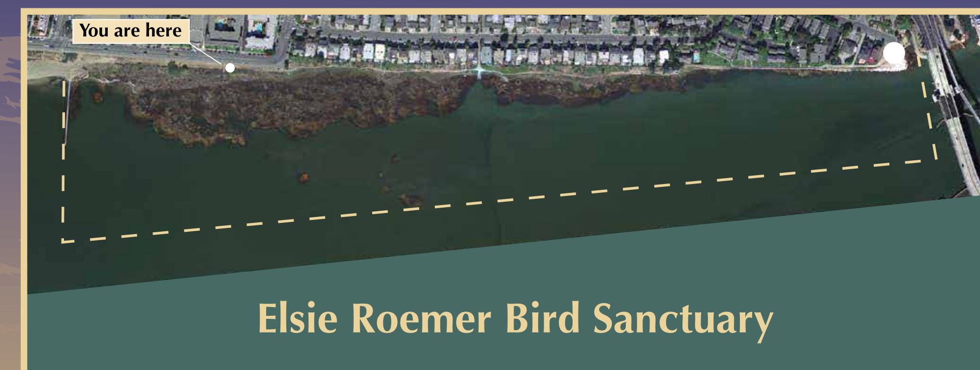
Elsie Roemer Bird Sanctuary

Elsie Roemer 2/21/79